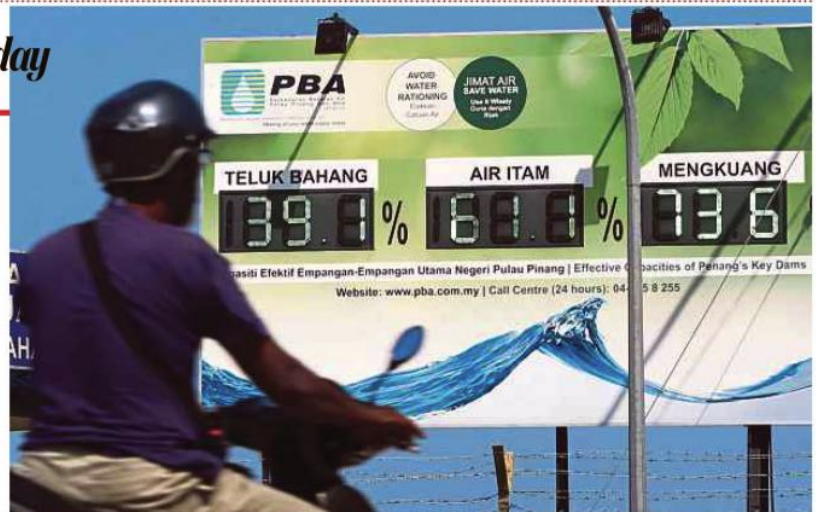
The key dams in Penang have seen their water levels falling since Christmas.

From September to December last year, the total rainfall record-