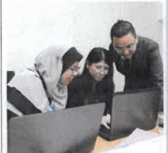
Staff from Deloitte Malaysia audited the results

Winners of the Highest Returns to Shareholders award are based on total returns,